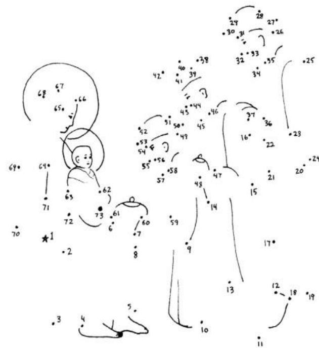
The feast of the Epiphany of Our Lord is a special part of the Christmas season! What are we celebrating on this feast?