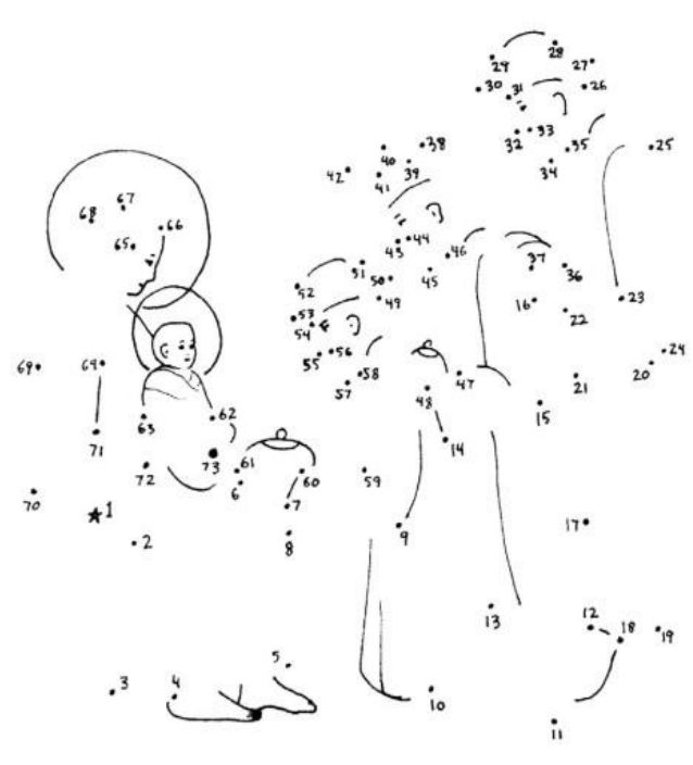
The feast of the Epiphany of Our Lord is a special part of the Christmas season! What are we celebrating on this feast?