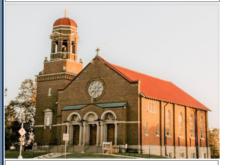
PALM SUNDAY OF THE PASSION OF THE LORD APRIL 13, 2025

Parish website: www.saintpetersparish.net